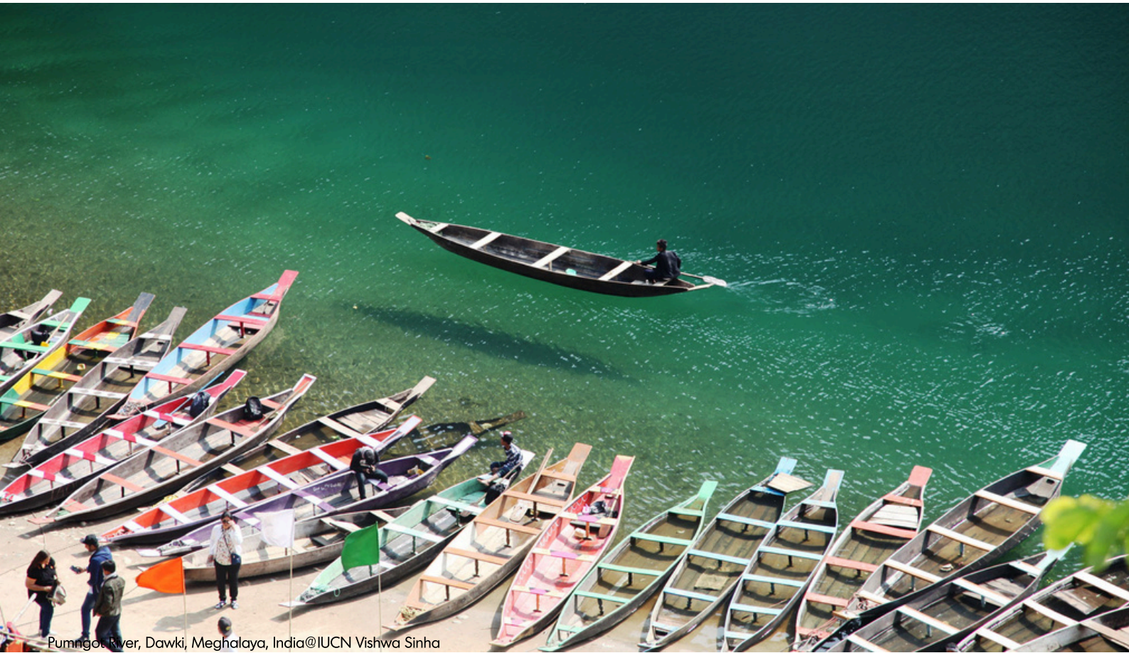
Purnagora River, Dawki, Meghalaya, India