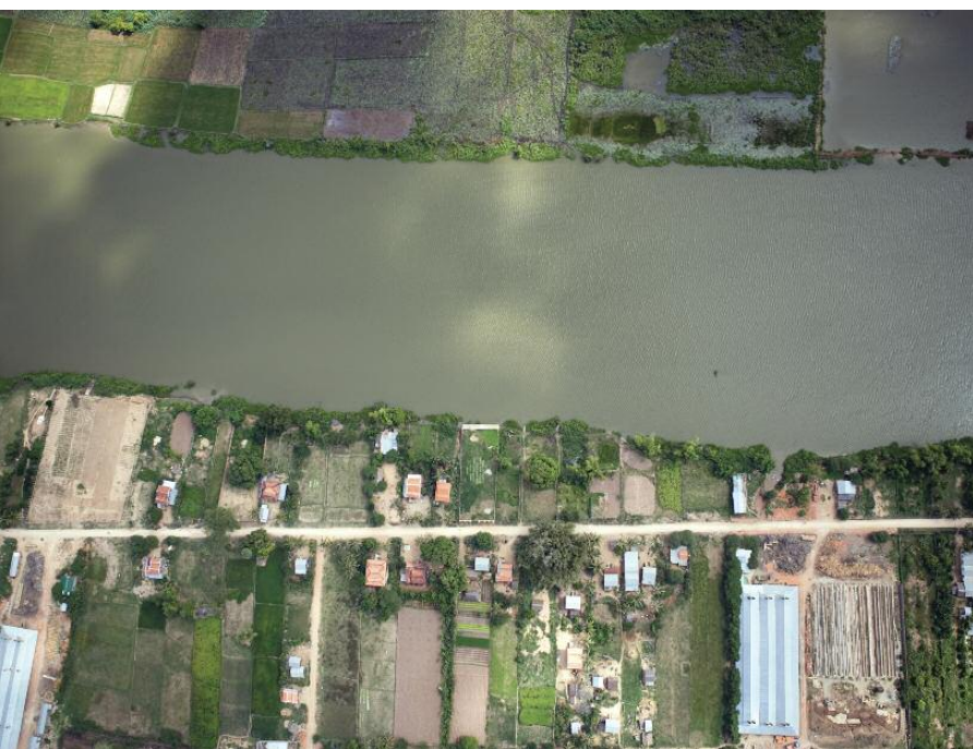
Intensive use of the river banks of the Mekong for cultivation

There were important overlaps between the WANI Huong and Mekong river projects. Environmental flows demonstrations in Viet Nam and Thailand were the basis for region-wide awareness raising and capacity building. This focused on the promotion and application of the WANI toolkit FLOW – the essentials of environmental flows and included translation of the toolkit into six regional languages: Vietnamese, Chinese, Thai, Khmer, Lao and Burmese. Translations were led by inter-disciplinary working groups in each case, ensuring translation of the concepts rather than just the words, and successfully building national-level ownership of the concepts and a constituency advocating and promoting flow application in each country.