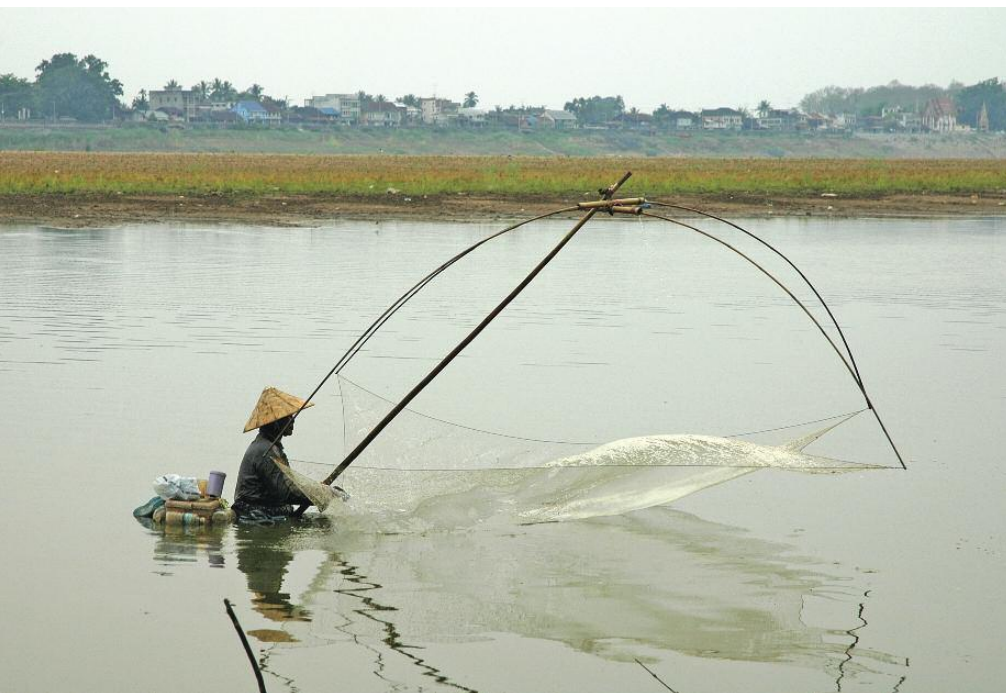
Lao woman fishing in the Mekong

the needs and priorities of local people are fully represented. This approach can be successfully applied in other basins if it is tailored to local contexts and the results and benefits are clearly articulated. The Tai Baan model of village research was successfully applied in the Songkhram basin and has resulted in the establishment of a Tai Baan network that is promoting the approach throughout Thailand and other Mekong countries.