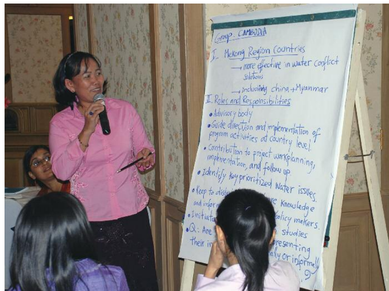
Mekong Water Dialogues multi-stakeholder meeting in Cambodia

It should be noted that while dams can alter the flow of the river with an array of consequences, they can also bring benefits in terms of raising living standards, increasing access to electricity for many households and infrastructure and development opportunities. The subject of dams and other