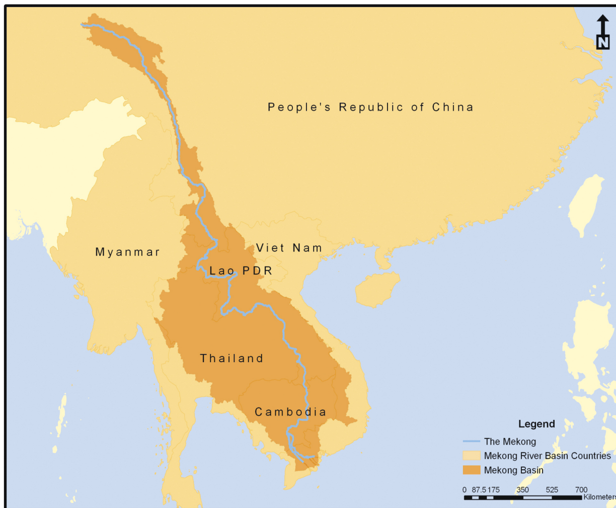
Figure 1. Map of the Mekong River Basin