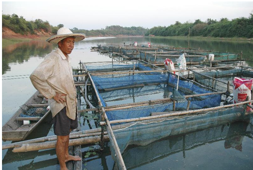
Fisherman on the Songkhram River

The WANI project in the Huong Basin in Viet Nam focused on healthy ecosystems and prosperity for the diverse peoples who depend on them for their livelihoods. The Huong River Basin rapid environmental flows assessment, completed in 2005 and coordinated by WANI, was the first ever undertaken in Viet Nam. Broad interest in the concept emerged, setting off a process of learning and scaling up at national and regional levels. The Huong environmental flows work was instrumental in the environmental flows work in Thailand.