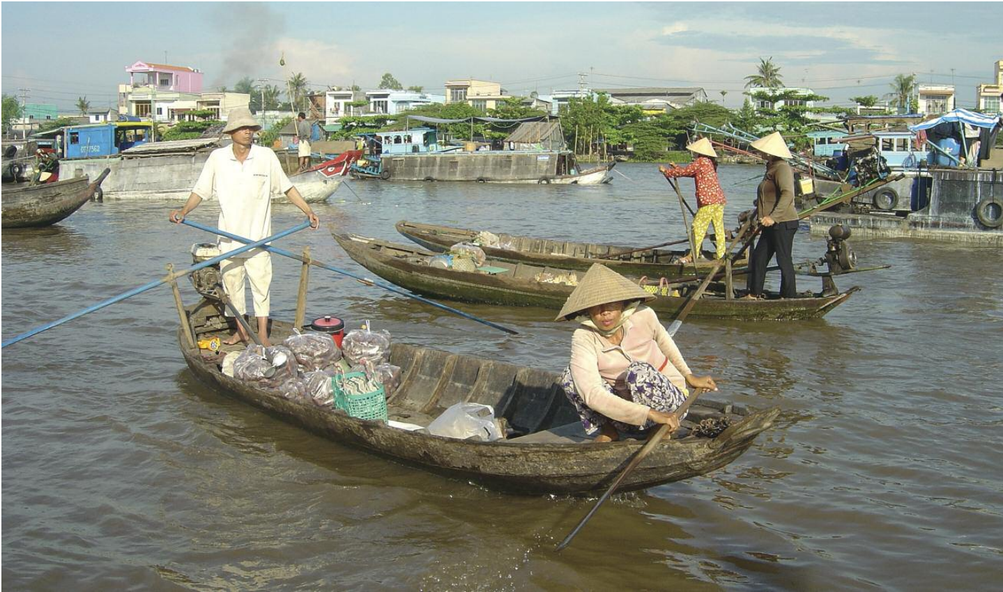
Floating market in the Mekong Delta