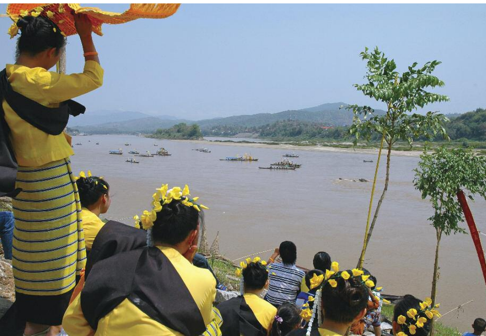
Girls in traditional costume watching the boat parade held to open the annual Giant Catfish Festival Chiang Khong, Thailand

WANI co-convened the 'Mekong Region Waters Dialogue: Exploring Water Futures Together' multi-stakeholder platform in 2006 to put the principles of sustainable development of water resources into practice. This was a regional multi-stakeholder platform organized to provide opportunity for a high quality, multifaceted debate and learning aiming to improve water governance in the Mekong Region. In addition, National Working Groups, comprising representative experts from government, civil society/non-government organisations, the private sector and academia/research sector were formed to guide the implementation of the Mekong Region Water Dialogues in each country.