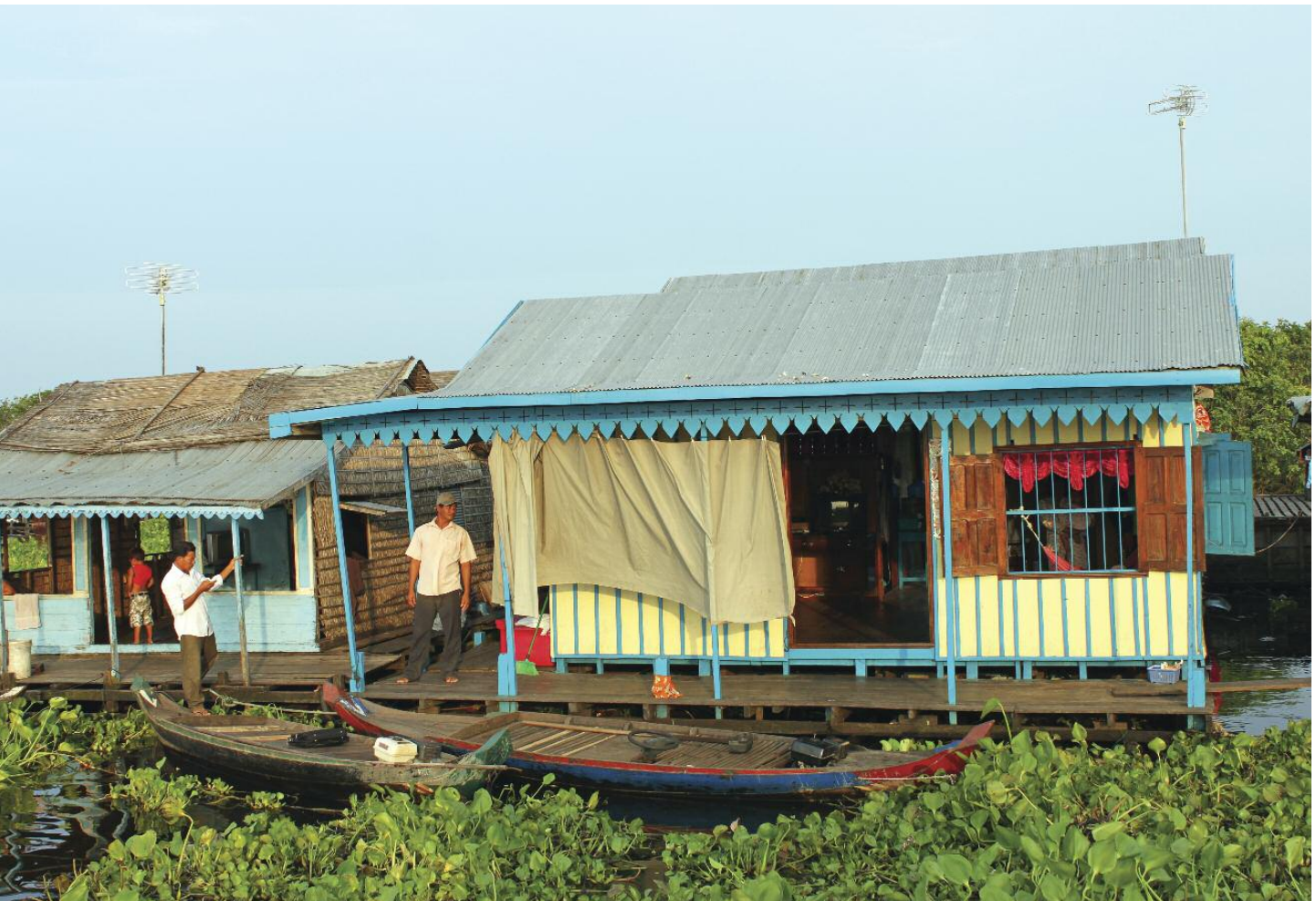
Floating Village in Tonlé Sap, Cambodia

Cambodia) which are important tributaries of the Mekong and contribute 20% of the total flow of the mainstream Mekong. The process has started by focusing on building up national commissions to manage each basin which will eventually be scaled up to a basin wide commission.