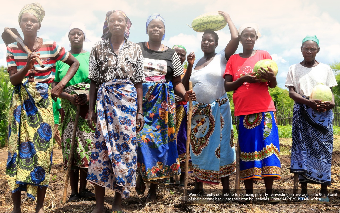
Women directly contribute to reducing poverty, reinvesting on average up to 90 percent of their income back into their own households.