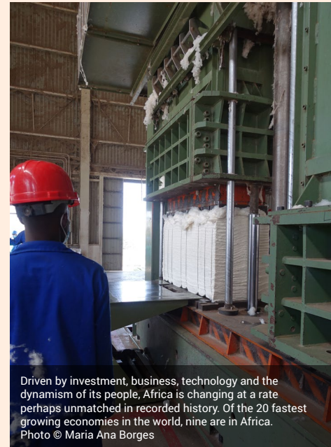
Driven by investment, business, technology and the dynamism of its people, Africa is changing at a rate perhaps unmatched in recorded history. Of the 20 fastest growing economies in the world, nine are in Africa.